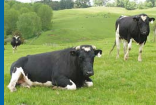
Bulls at Puketotara

Computershare Investor Services Limited Level 2, 159 Hurstmere Road, Takapuna Private Bag 92119 Auckland 1142 Telephone 09 488 8700 Facsimile 09 488 8787