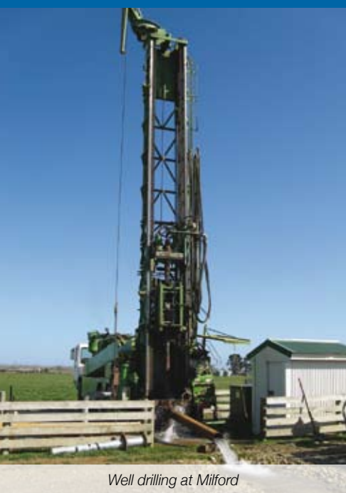
Well drilling at Milford