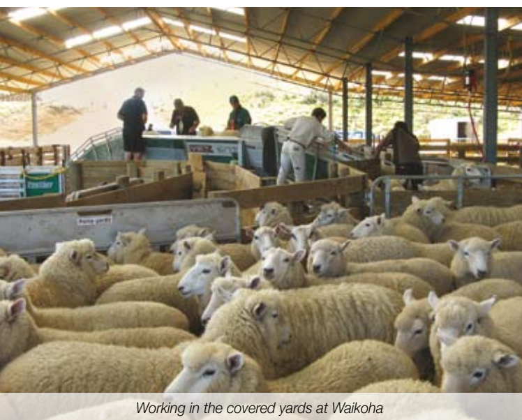
Working in the covered yards at Waikoha

Significant earnings and value growth is expected from these three farms over the next five years as the farm development programme moves to completion. Further detail on this programme is provided in the Farming Review section of this report.