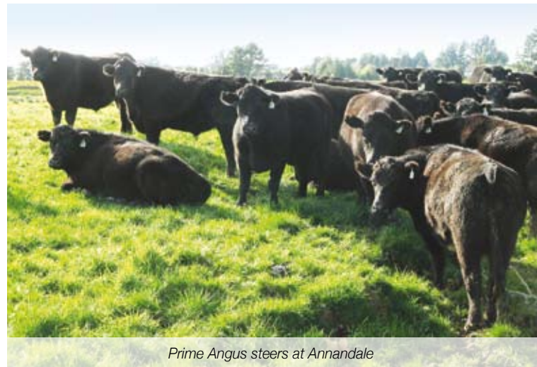
Prime Angus steers at Annandale

Farm sales are expected to be slow amidst continuing tightness of credit from banks, relatively low numbers of farms genuinely for sale and little appetite for risk from buyers. Accordingly the rural property market is likely to remain flat with little capital growth expected whilst these market conditions continue.