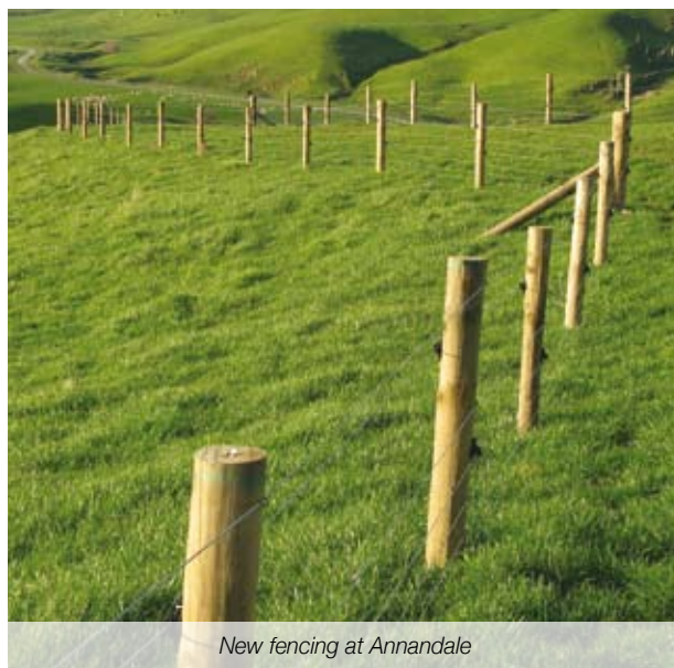
New fencing at Annandale