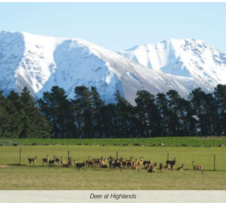
Deer at Highlands