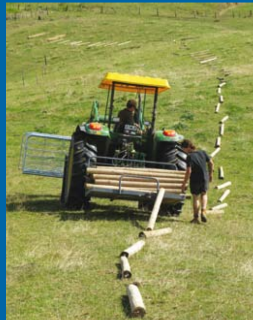
Laying a new fenceline at Annandale