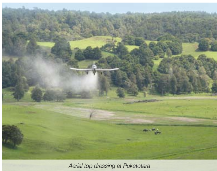
Aerial top dressing at Puketotara

Whilst there has been some recovery in world financial markets and commodity prices, considerable volatility remains and the world economy is fragile. The New Zealand economy is no exception and whilst capital is available to fund land purchases, provided strict lending criteria can be met, there is still low demand from buyers who have less appetite for risk in these uncertain times. Consequently relatively few property sales have occurred and property values have continued to ease across all farming sectors.