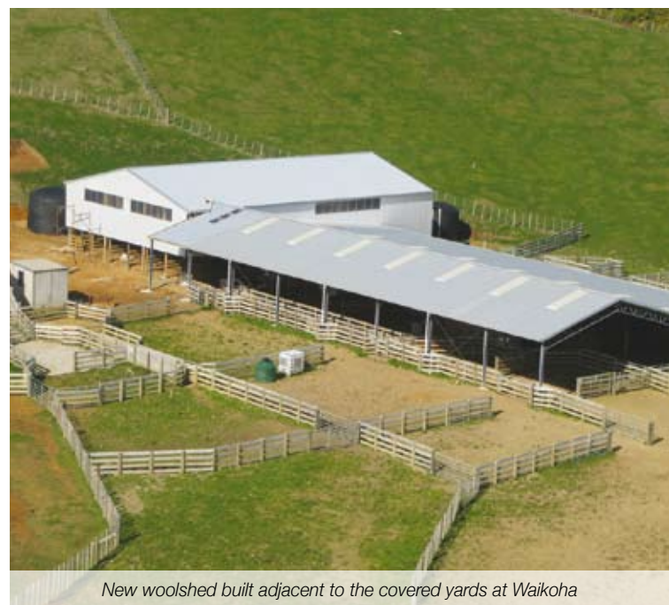
New woolshed built adjacent to the covered yards at Waikoha

As part of the Waikato group, Waikoha will become a specialist breeding unit with all surplus progeny being sent to Annandale or Puketotara for finishing. The carrying capacity of Waikoha is expected to increase from 13,000 to 18,000 stock units over the next five or so years as a result of the development which will significantly improve both farm income and capital value.